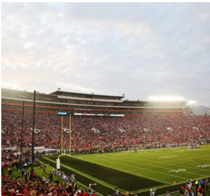
GRIGG products are used and trusted by some of the most notable sports stadiums in the world - including the Rose Bowl Stadium®.

Turfgrass managers around the world are taking advantage of highly efficient GRIGG Proven Foliar nutrients. Produced with the highest quality ingredients, these proprietary formulations provide unparalleled nutrient uptake and assimilation. GRIGG offers science-based solutions and focuses on research and education. They remain dedicated to validating products and programs through university research and proven field results.